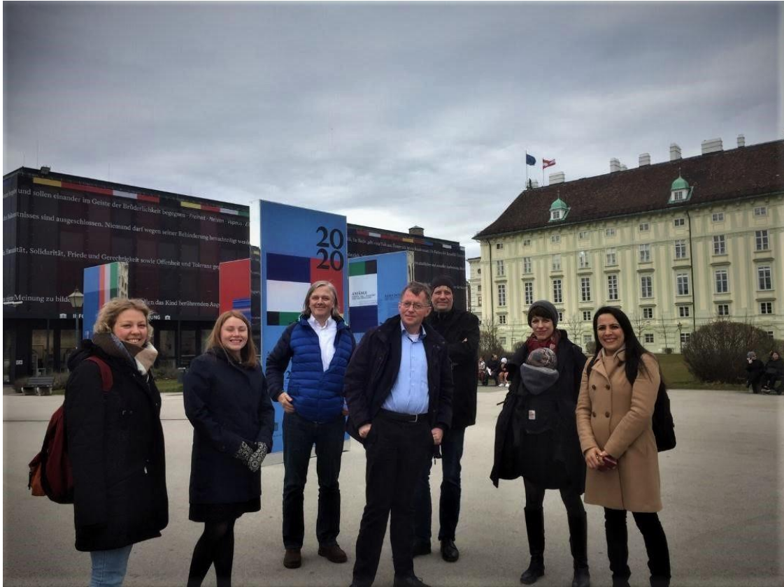
Part of the MIDDEL-project team, International kick-off meeting in Vienna 24-26 February 2020