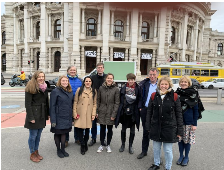
MIDDEL-project team, International kick-off meeting in Vienna 24-26 February 2020