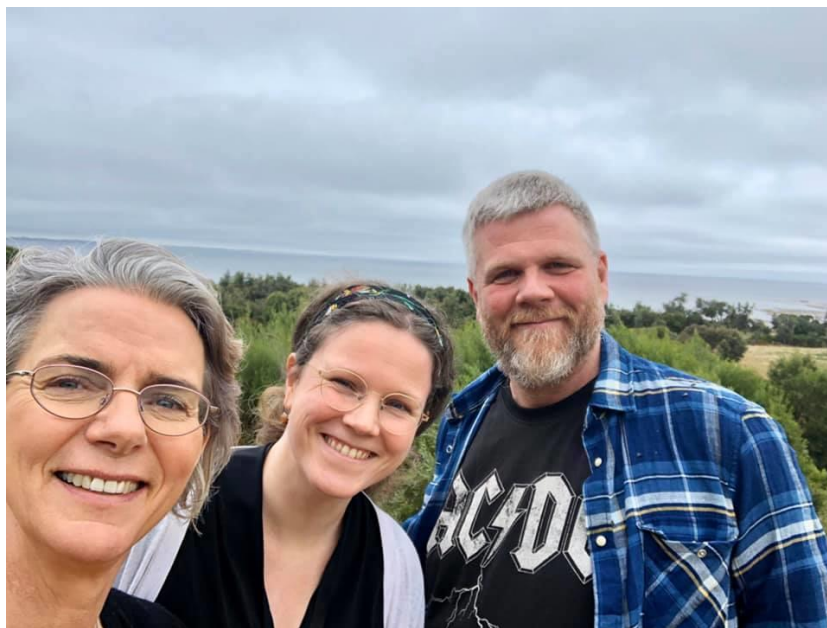
Consortium meeting in Melbourne, 3- 4 February 2020, Photo: Privat

Attunement in music therapy - addressing sensory and affective issues with children with ASC. Scientific Meeting Autism Spectrum (WTAS) (cancelled due to Covid-19); 2020-03-30 - 2020-03-31 NORCE UiB