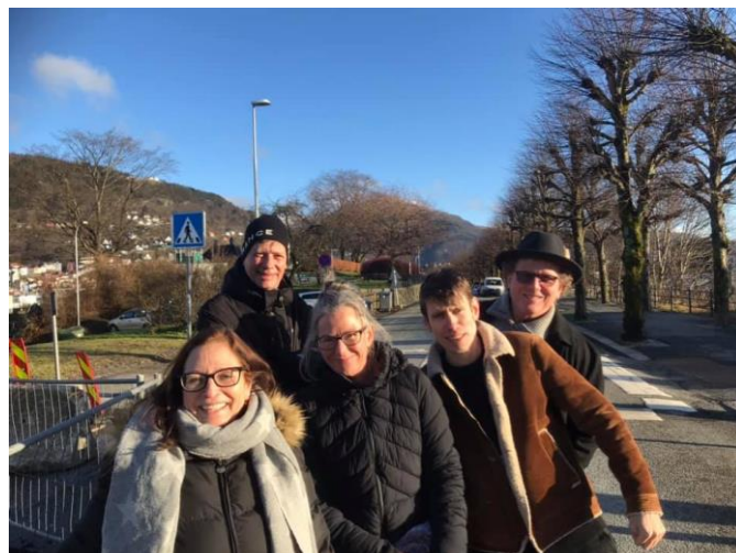
GAMUT social event February 2020