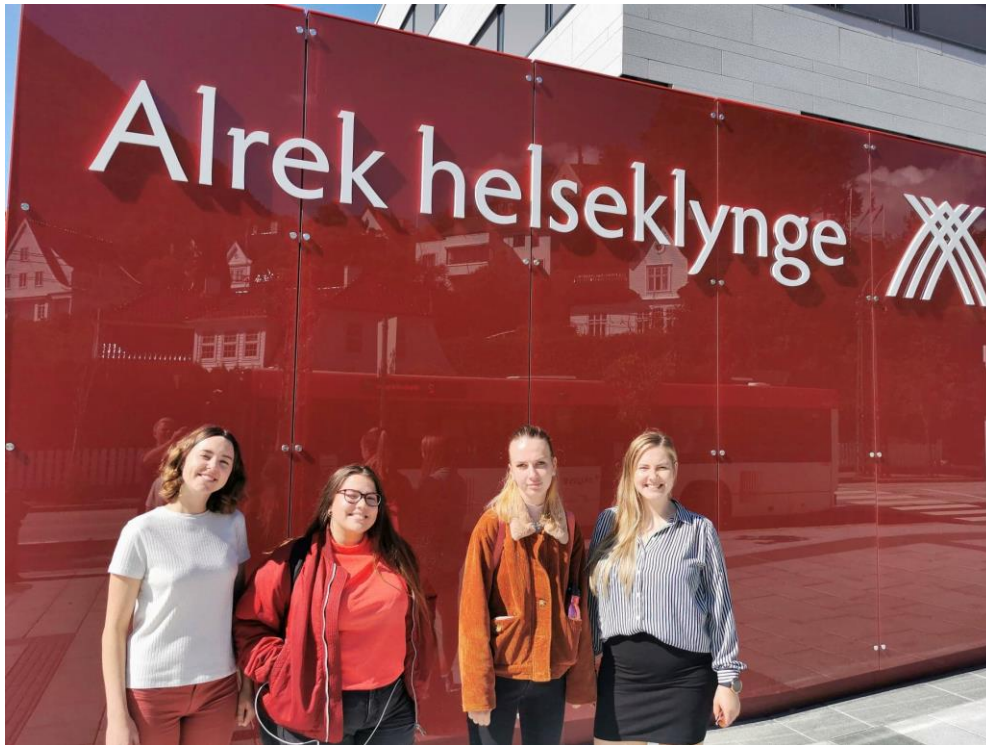
«Kom nærmere» på åpningen av Alrek helseklyngebygget, 10. August 2020.