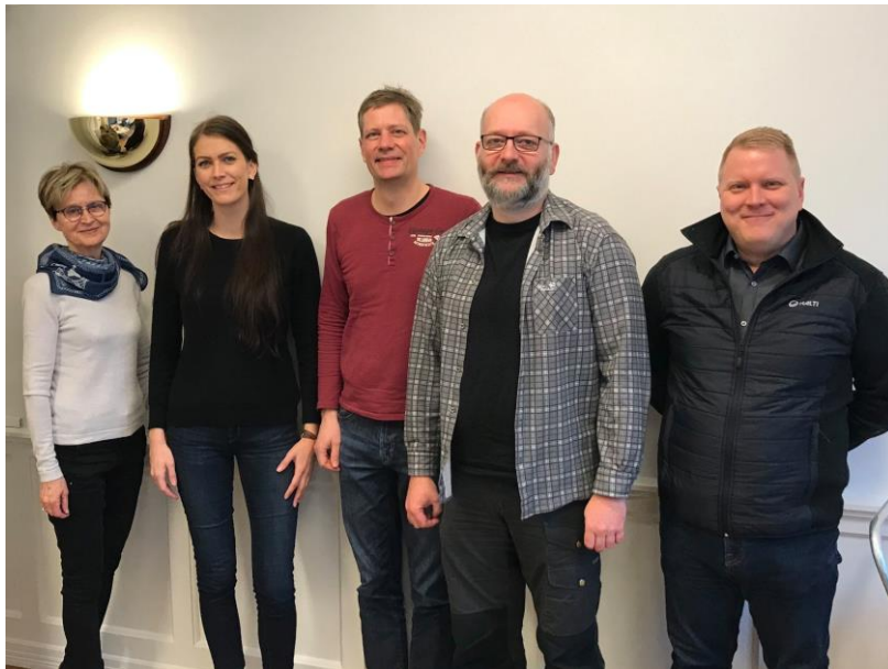
The first meeting of the Data and Safety Monitoring Committee (DSMC) in MIDDEL.