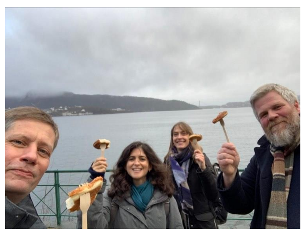
GAMUT social event December 2021, Photo: Viggo Krüger

NRK P3 [radio] – 18.05.2021. "Hva gjør musikken med oss", med intervju med Viggo Krüger.