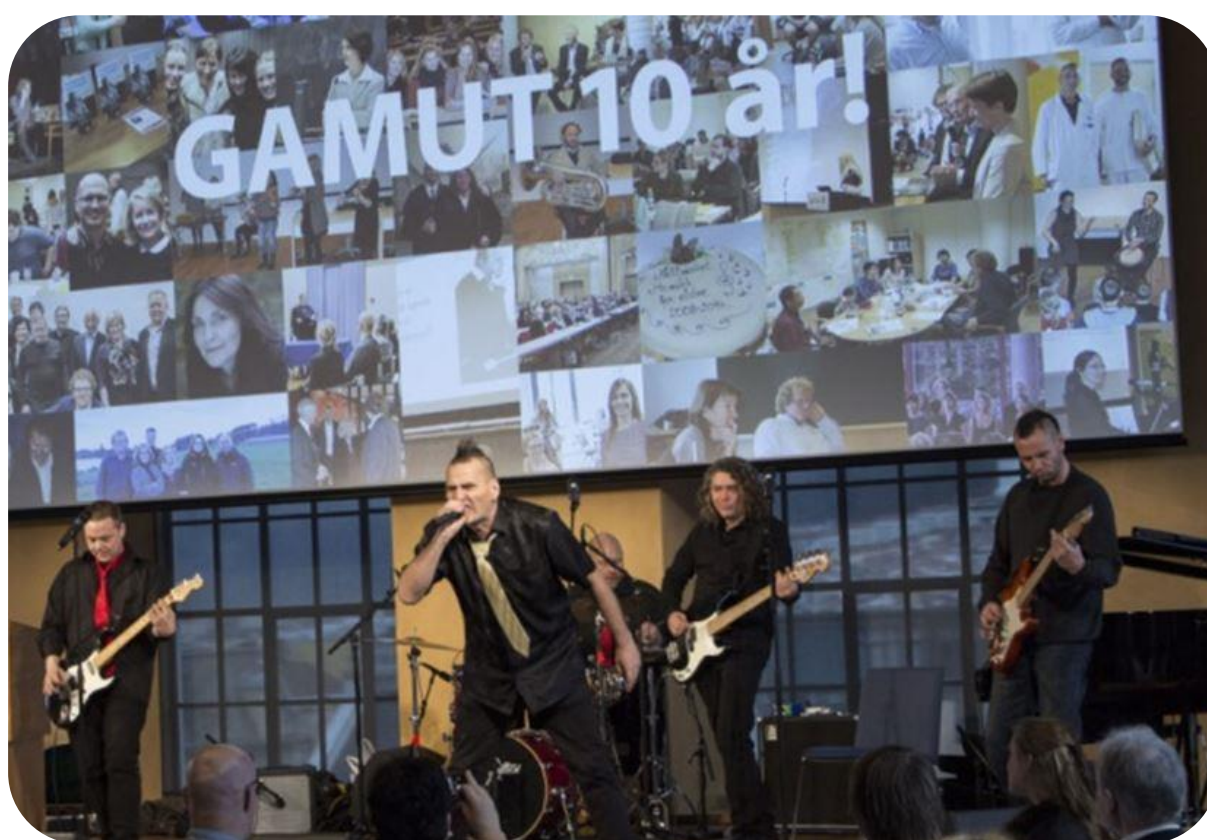
The band Gatens Evangelium (The Gospel of the Street) at the GAMUT 10 years anniversary symposium.