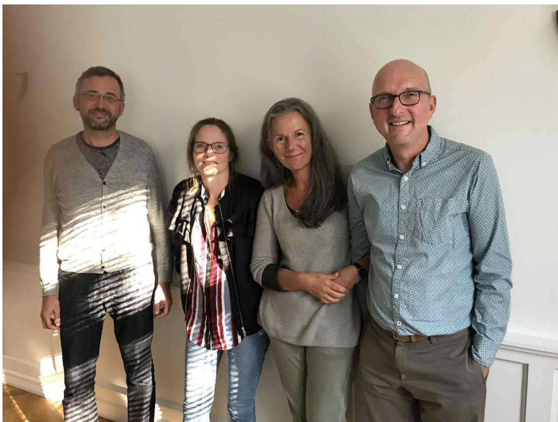
Care for music project group

Proposed funding: EU-H2020-Societal Challenge6, EUR 3 million.