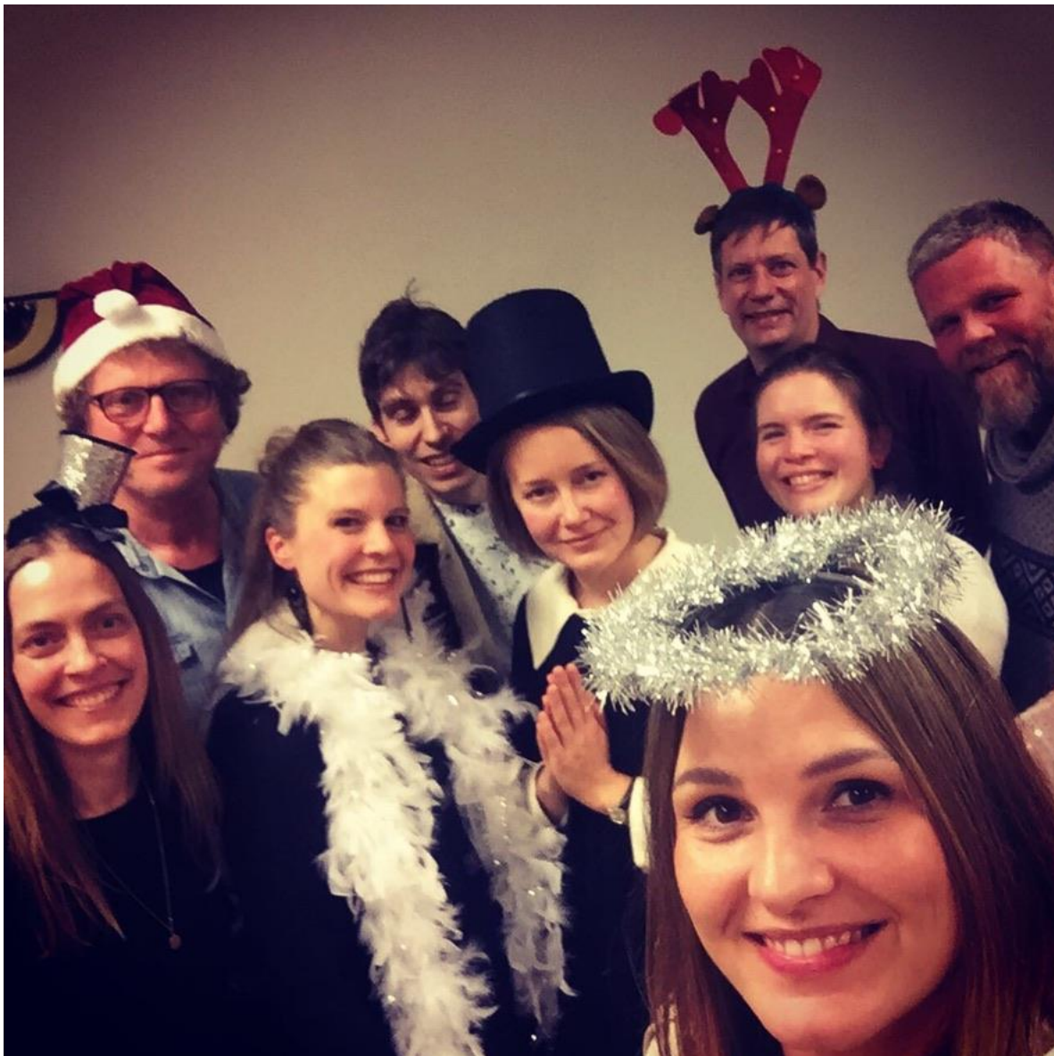
GAMUT holiday party 2019

Bergens Tidende/Aftenposten/Adresseavisen – 20.12.2019. Artikkel om Anita sin tilfriskningsprosess med bl.a. aktiv bruk av musikkterapi, inkl. intervju med m.a. Viggo Krüger.