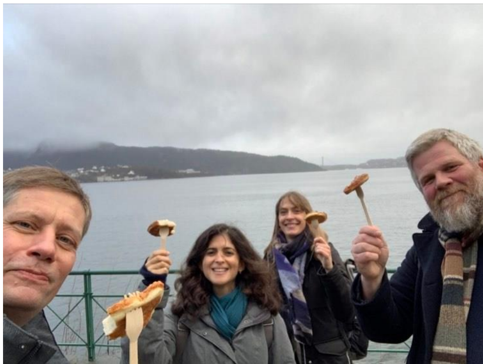
GAMUT social event December 2021

NRK P3 [radio] – 18.05.2021. “Hva gjør musikken med oss”, med intervju med Viggo Krüger.